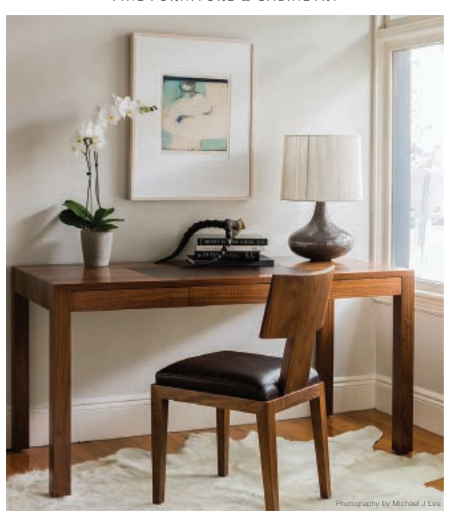
357 Huron Avenue Cambridge, MA 02138